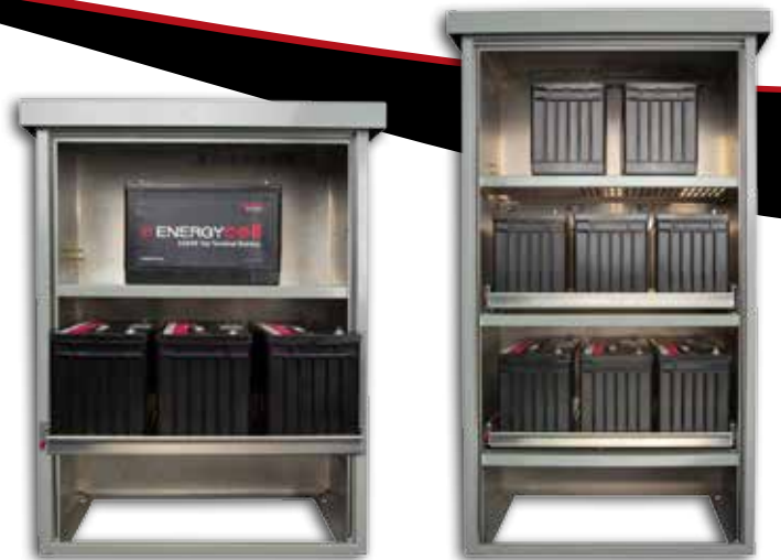
IBE-1 and IBE-2 Enclosures with EnergyCell RE Top Terminal Batteries

Available in two sizes, the IBE-1 accommodates up to four EnergyCell 106RE Top Terminal batteries. The larger IBE-2 is designed to accommodate up to eight EnergyCell 106RE Top Terminal batteries.